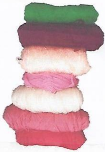
suggested wool colours.