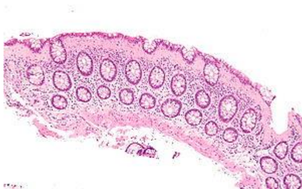
Micrograph of collagenous colitis, a type of microscopic colitis. There are two types of microscopic colitis.

Always discuss medications with your doctor or healthcare professional and do not stop taking any medications without their advice first.