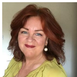
CEO, Guts UK Charity